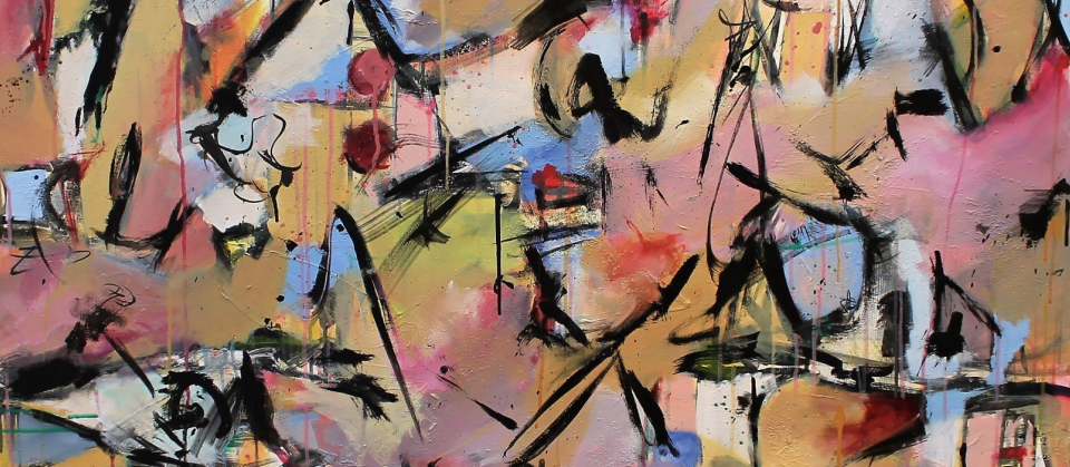
Bus Journey I, Acrylics on Canvas, 127cm x 90cm