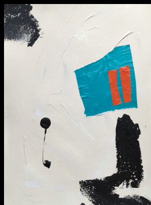
Collection 'Autismo 25': each piece (25 in total) are approx. 19cm x 27cm (unframed), approx. 21cm x 29cm (framed), Mixed Media on Paper.