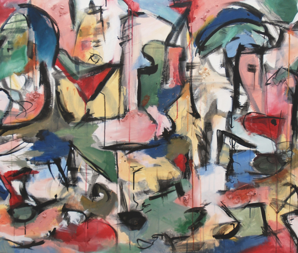
Bus Journey II, Acrylics on Canvas, 127cm x 90cm